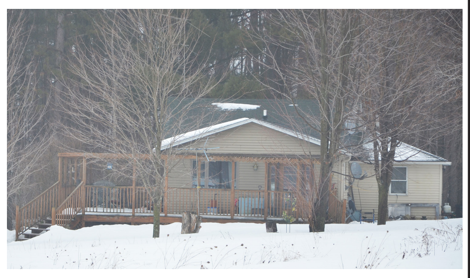
W12805 Cty Highway A

Almost 5 acres of land; Sold as is: $147,000