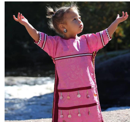
Strength, Hope, Resilience

We are at a time where we must, as a tribe, make adjustments as we continue to address the unique challenges due to impact of COVID-19 (coronavirus), pandemic situation and extension of order, and must now also address and adjust our original timeframe to safely reopen our business and