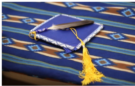
Class of 2020

To the Class of 2020 the Mohican Nation extends our congratulations and well wishes and wants to acknowledge how very proud we are of you and your hard work.