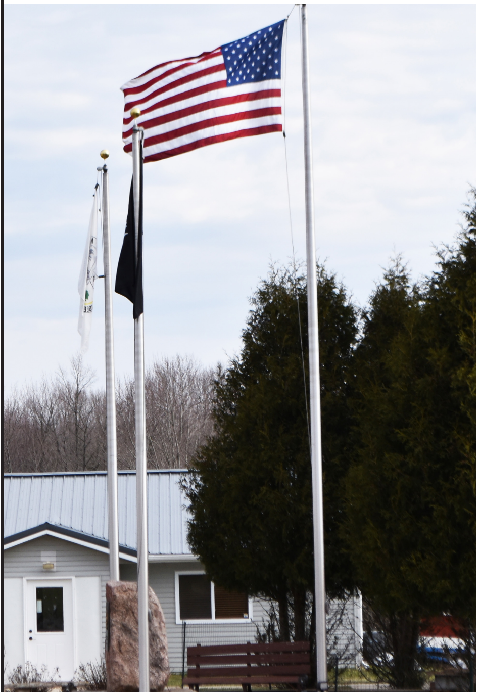
Flags still flying at the Mohican Veterans Memorial. Thanks to you all!