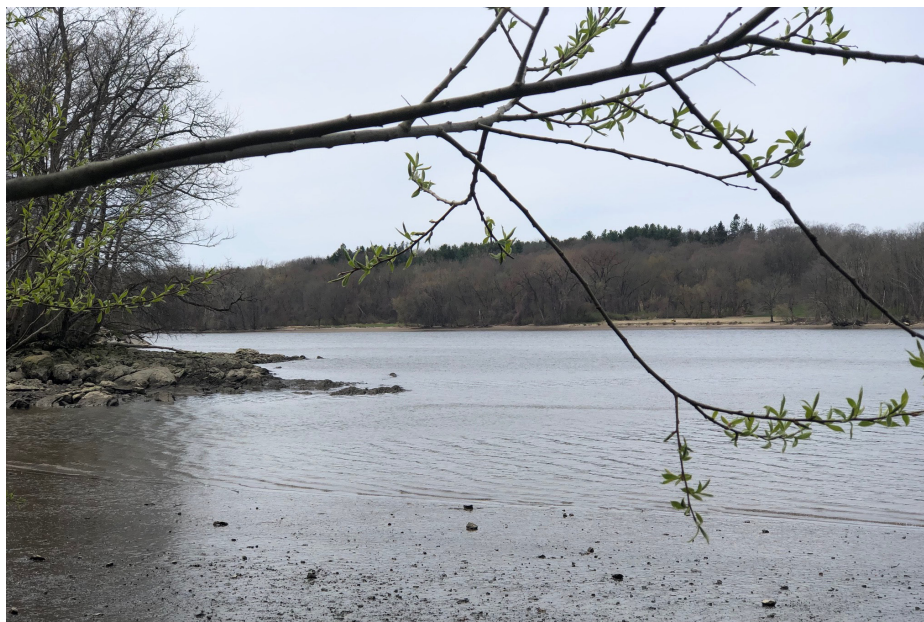
Spring view of Hudson River from Papscaanee Island, Mohican cultural site, April 2020