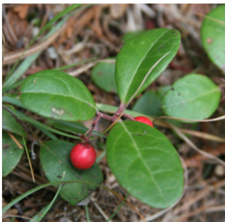
Wintergreen Photo taken in October