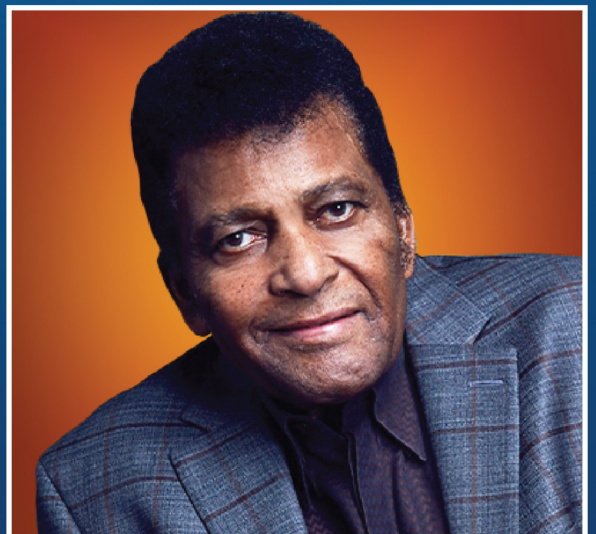
Charley Pride May 18

For more information, please visit our website