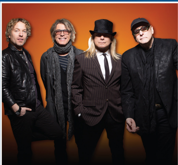
Cheap Trick March 9