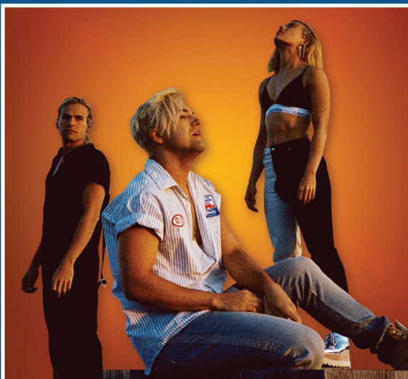
The Band Perry April 13