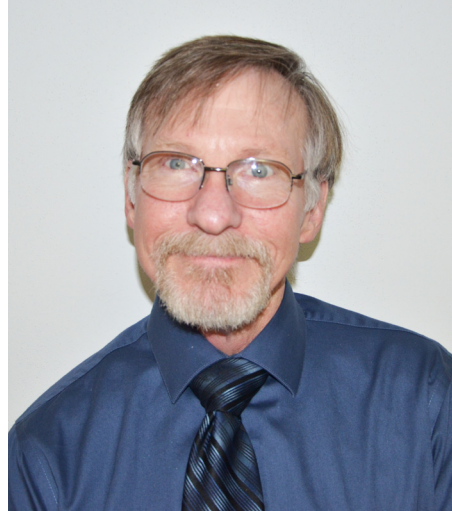
Tribal CIO/IT Director