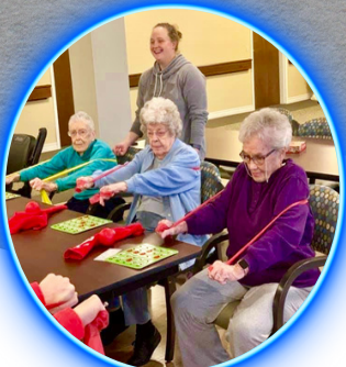
Exercise Only Workshop!